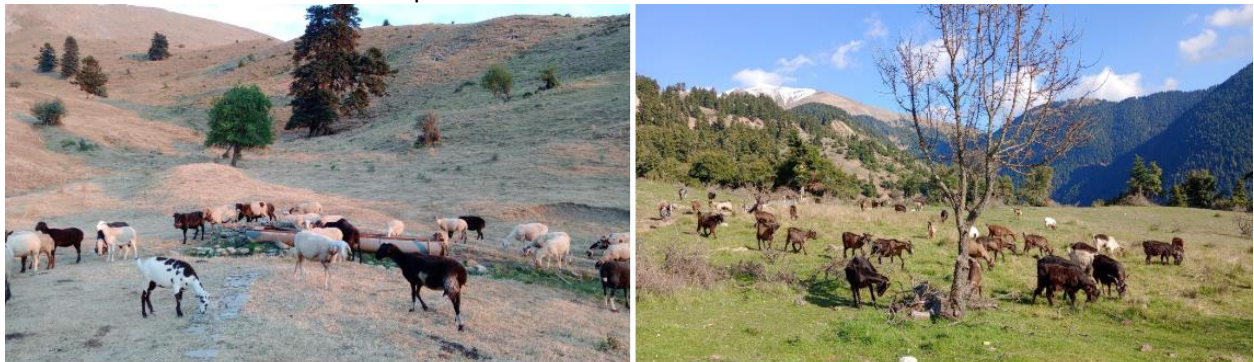
Fig. 4-5 The farmers of the community cooperate with the Laboratory of Agroforestry and Forest Soil Science of the Department of Forestry & Natural Environment Management, and maintain family livestock units of extensive traditional livestock farming. During the summer period, they move their herds to the anodasic woodlands of Tymfristos, faithful to the intangible cultural heritage of their ancestors.

For the protection and conservation of mountain forest grasslands, holistic management is required, compatible with local traditional land use, supporting traditional livestock and beekeeping, as well as the establishment of a systematic programme of long-term monitoring of habitats and their ecosystem services. This will help to strengthen local communities and make both people and the natural environment more resilient to the pressures of the climate crisis.